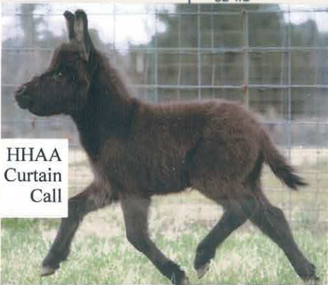
HHAA Curtain Call